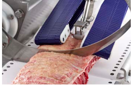
Product supported by product holder & back hold fork during cutting