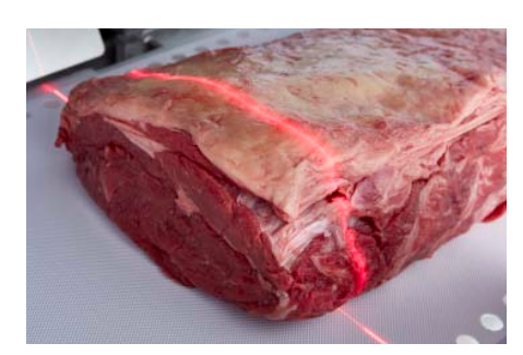
Product under vision system